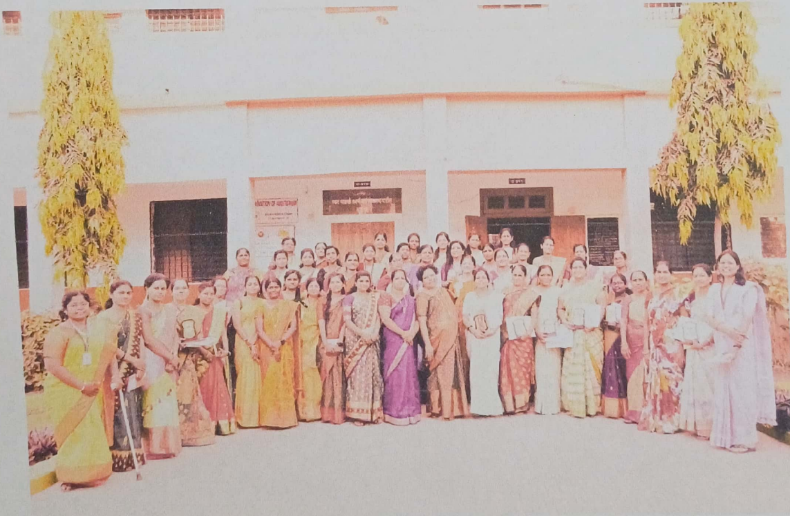
All Ladies Staff at K. B. P .M. Pandharpur